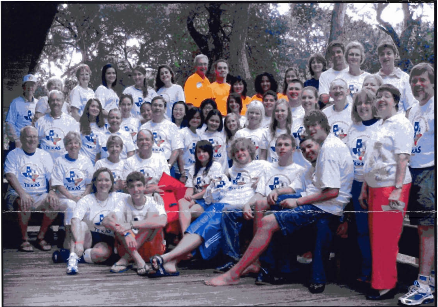
YE attendees from Alabama, Arkansas, Kansas, Louisiana, New Mexico, Mississippi, Missouri, Oklahoma, Tennessee, Texas