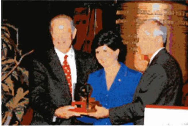
Secretary Jim Baker receives his award from 95 th Club President Vicki Brentin and Club Foundation President Phil Hampton - a proud Rotary moment.