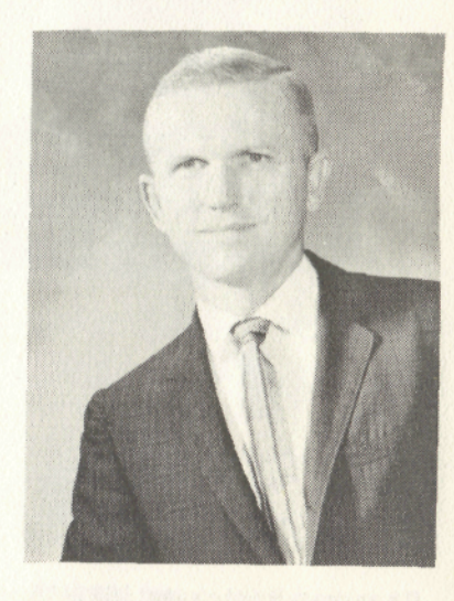
FRANK BORMAN Astronaut, Col. U.S. Air Force