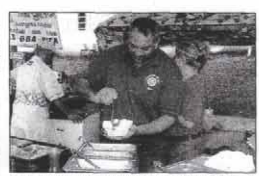
South Shore Wine & Food Festival is League City Rotary's big fundraiser.