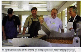
It's hard work cooking all the shrimp for the Space Center Rotary Shrimptore, but...