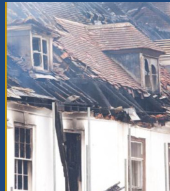
Complete Identity Restoration