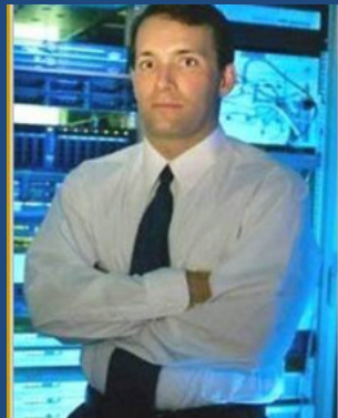
24 Hour Credit Monitoring