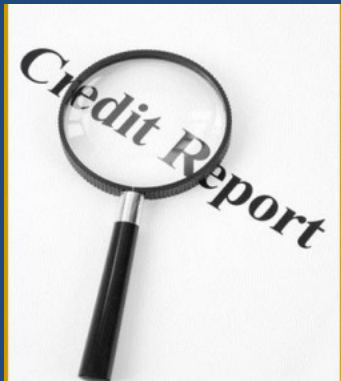
Complete Credit Analysis